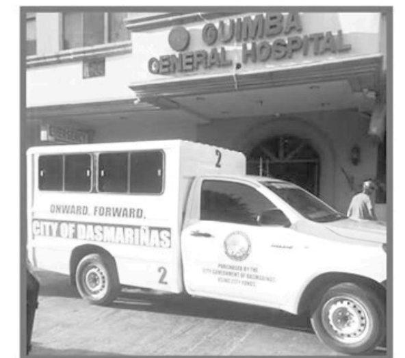
PAMAHALAANG LUNGSOD NG DASMARIÑAS

Sa kabila ng krisis na dulot ng Coronavirus Disease-2019 (COVID-19), hindi dapat mahinto ang pagtugon natin sa iba pang mga pangangailangan ng ating mga kababayan. Maraming salamat sa mga kawani ng ating Panteon de Dasmariñas.